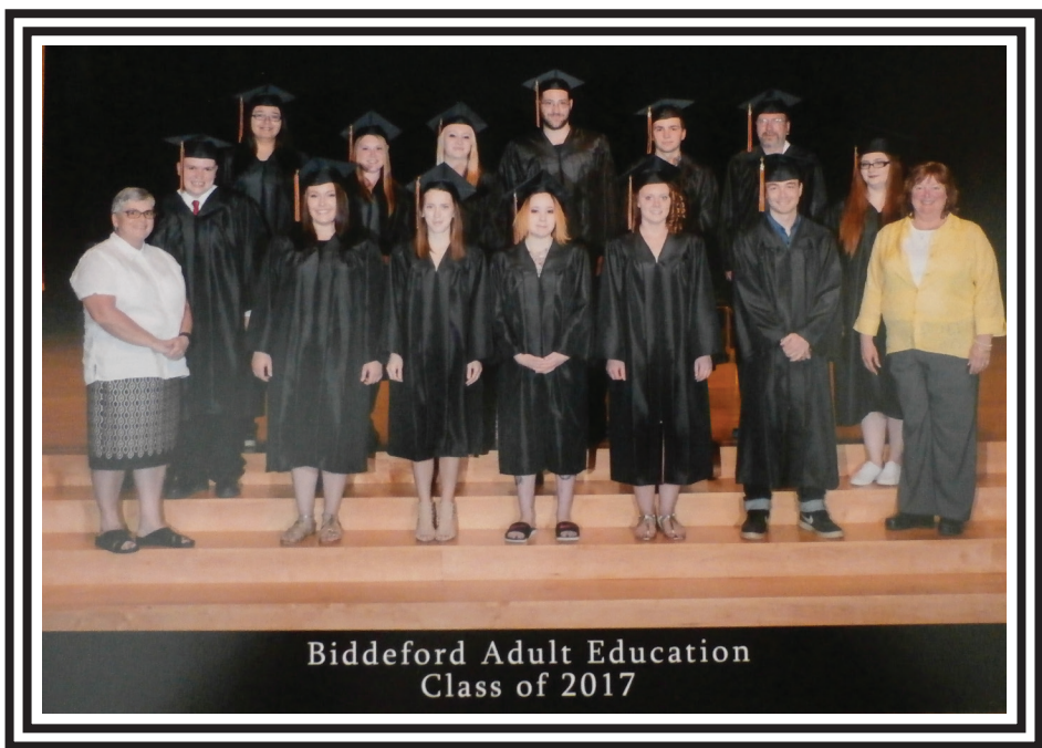
Biddeford Adult Education Class of 2017

Registration begins January 2nd Classes begin January 22nd High School Diploma classes: Six students is the required number to "make a class"